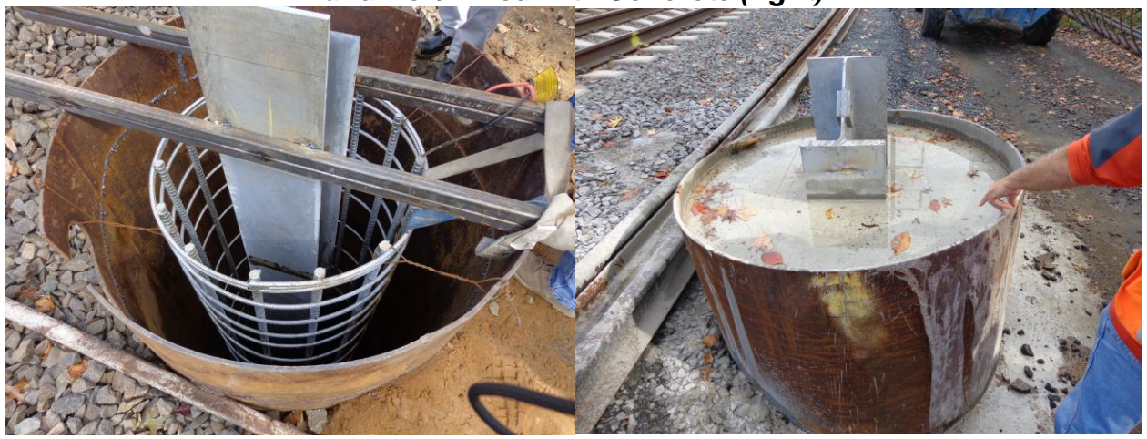
Figure 1. Catenary Hole Drilled and Set with Rebar (left) and Hole Filled with Concrete (right)